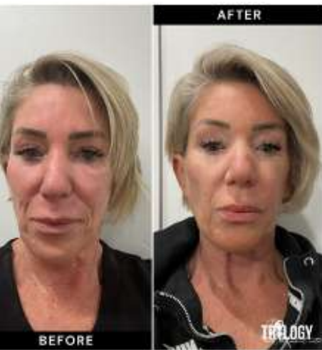
SYLFIRM PRETTY PASS